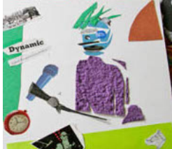
collage detail, student work

Here is a description of a workshop I gave on Romare Bearden . We listened to jazz, examined his artwork, and made collages. Scroll down for photos of student work , and links to Bearden art activities at the Metropolitan Museum and more. Making a collage is the perfect indoor activity, and a great way to recycle magazines, newspapers, travel brochures, maps, old Christmas cards, food labels... you are limited only by your imagination.