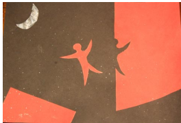
Papercut detail by Alexandra