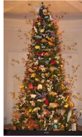
Origami Tree, AMNH