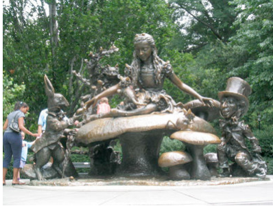
Alice in Wonderland statue in Central Park

When my kids were young we created our own Mommy-and-Me Summercamp. With all of the free and cheap resources in NYC , I found great opportunities that I could tailor to my child. Read more , where you'll find a list of the best water playgrounds and recommended summer reading for kids .