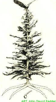
The Tree of Peace