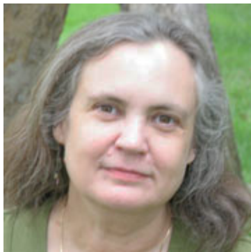
Laurie Block Spiegel